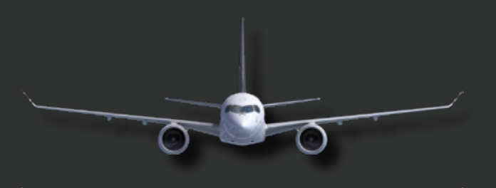
35.1 m / 115 ft 1 in