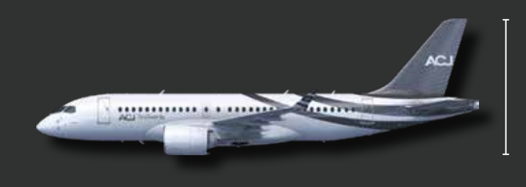
35 m / 114 ft 9 in